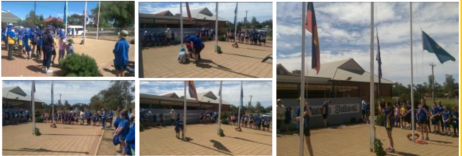
Memorial Day Service